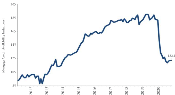
MORTGAGE CREDIT AVAILABILITY INDEX (NSA, 3/2012=100)

Source: Mortgage Bankers Association; Powered by Ellie Mae's AllRegs "Market Clarity"